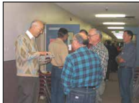
PFC-University A chance to learn, connect, & network.

More courses are being developed, including Ministering Healing and Understanding the Call of God in Christian Service . Over the years, Prisoners For Christ has sought to bring relevant