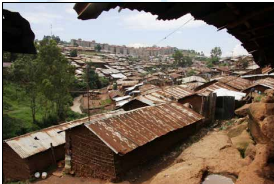
Kibera, Kenya, home to a high percentage of juvenile offenders