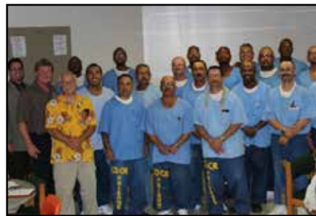
TUMI Students and Donors Ironwood Prison, CA

There are so many benefits to the inmates including: