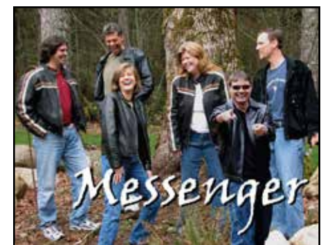
PFC Creative Artists MESSENGER Serving with PFC since 1990

This is why PFC started monthly outreach concerts in all of the Western WA prisons, some jails, and five juvenile facilities. PFC has almost 30 artists who