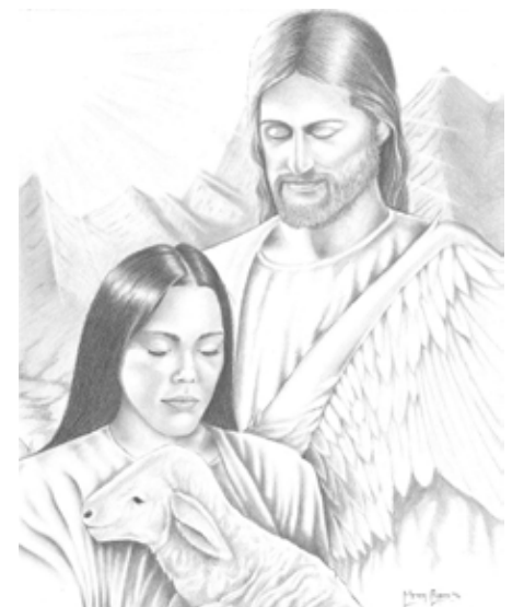
TRUSTED ANGEL by M. Gleed 2010 Honorable Mention Yard Out Inmate Art Contest

Printed three times in 2014, Yard Out is placed in 1,265 prisons with a circulation of 59,000 copies per issue. There is an extensive network of chapels and libraries with departments in every facility. Feedback from the institutions state that it is one of the most highly demanded newspapers in the system. "It's the paper of choice," said one chaplain. "Priceless," wrote another chaplain. "It brings true rehabilitation."