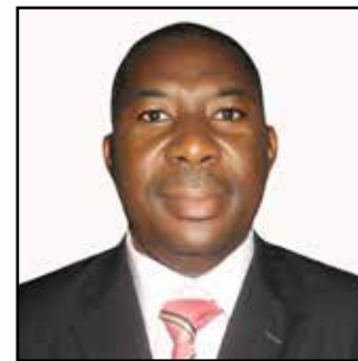
YEYE EMILE NIAMEY - Niger